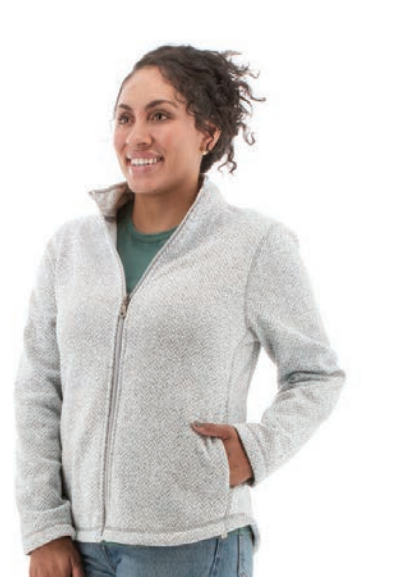
chevron pattern body • raglan sleeves faux button closures on cuffs