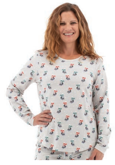
35" length • full button front