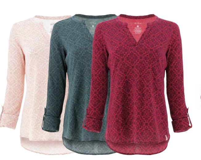
y-neck • 26" front length • 28" back length roll up sleeves w/ button closure