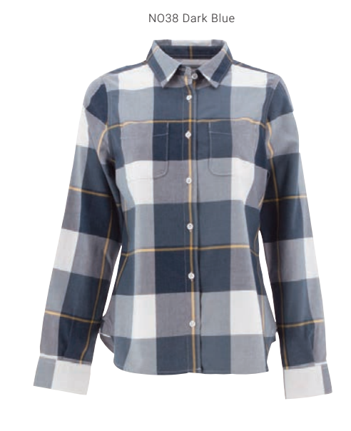
26.5" length • classic fit • 2 chest pockets