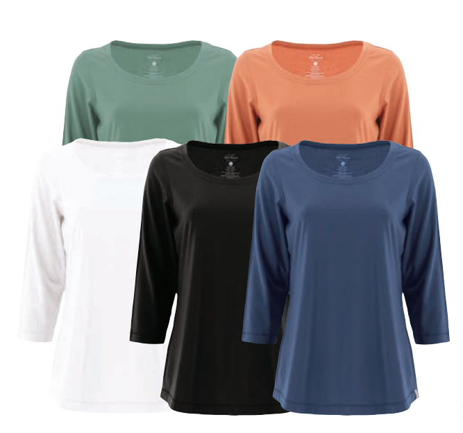
scoop neck • 3/4 sleeve