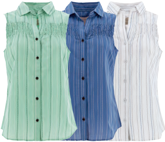
PH07 Green PH67 Cobalt PH71 Cloudburst