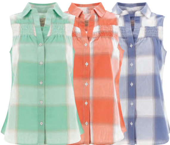
RE77 Jade RE82 Dark Coral RE83 Sapphire