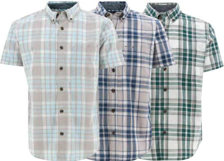
LT05 Light Blue LT76 Dark Denim LT77 Jade

single chest pocket with pen slot • button-down collar • locker loop