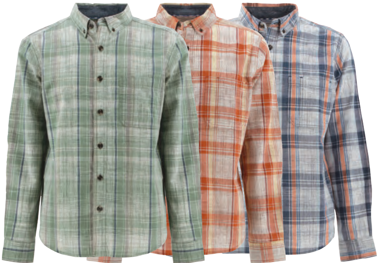
LV63 Sage LV70 Bombay Brown LV75 Denim