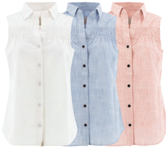
03LO White 12LO Blue Moon 53LO Salmon