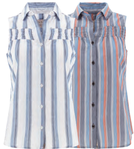
RF03 White Stripe RF51 Blue Stripe