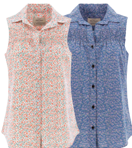
RD03 White Floral RD51 Blue Floral