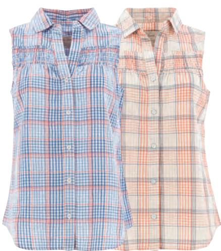
PG51 Blue PG72 Peach