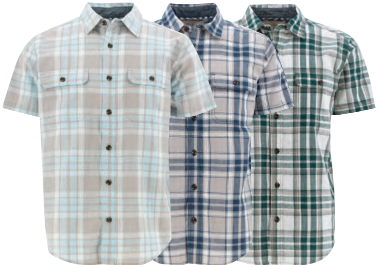
LT05 Light Blue LT76 Dark Denim LT77 Jade

2 chest pockets w/ button closure • pleats on back yoke