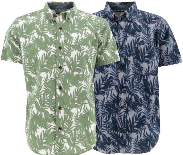
07PV Green 76PV Dark Denim