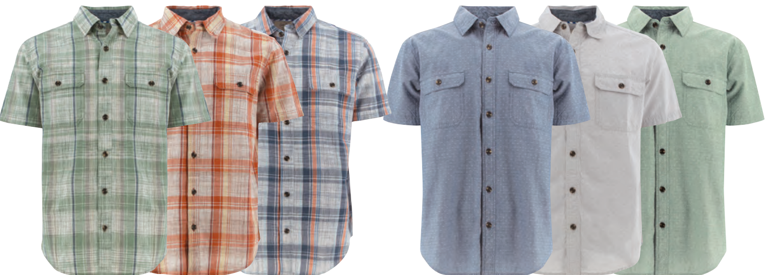
LV63 Sage LV70 Bombay Brown LV75 Denim LX38 Dark Blue LX48 Grey LX78 Leaf Green