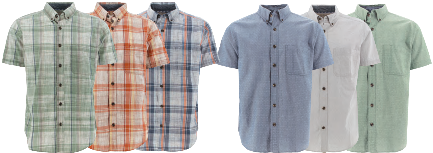
LV63 Sage LV70 Bombay Brown LV75 Denim LX38 Dark Blue LX48 Grey LX78 Leaf Green